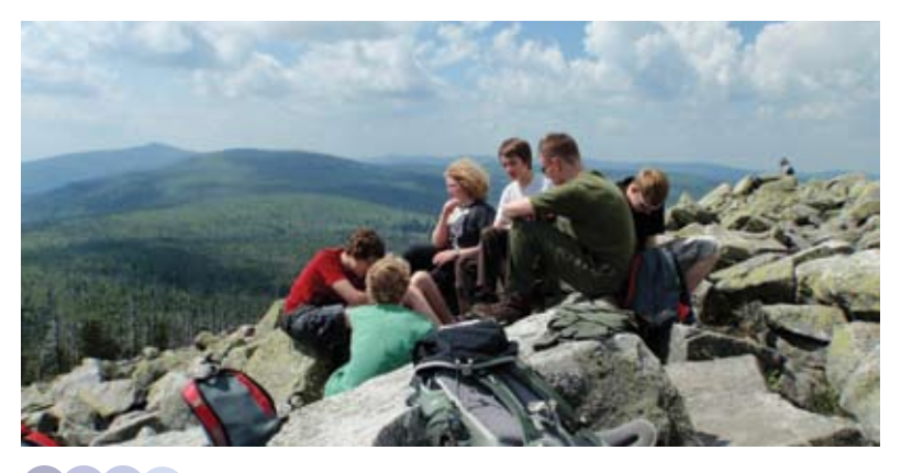
Over looking Bavarian Forest National Park

The next phase of the exchange programme happens this year when Bavarian Forest National Park Junior Rangers and adult mentors will take part in an exciting programme highlighting the best of the Cairngorms National Park.